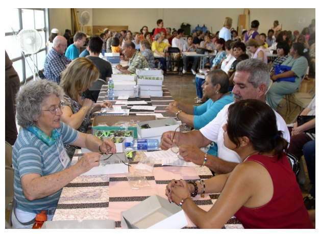
Mexico Eyeglass Team in 2010