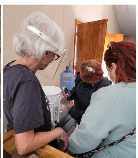
Nicaragua 2010 Uganda 2020 Mexico 2021