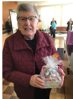
ADELAIDE PANERA GIFT CARD