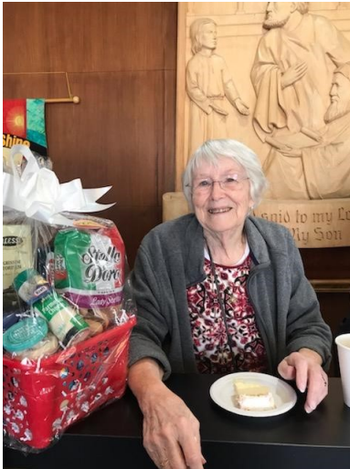
MARY PASTA BASKET