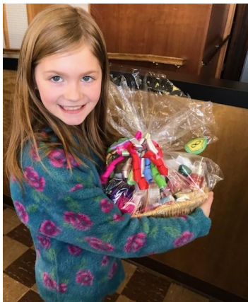
AMELIA SPA BASKET