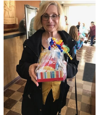
BEVERLY AMC GIFT CARD