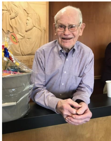
HERMAN SPRING CLEANING BASKET