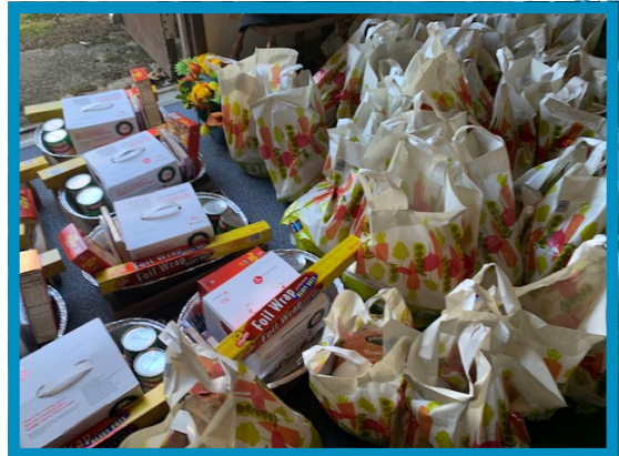
Food Pantry Thanksgiving Baskets & Our Volunteers!