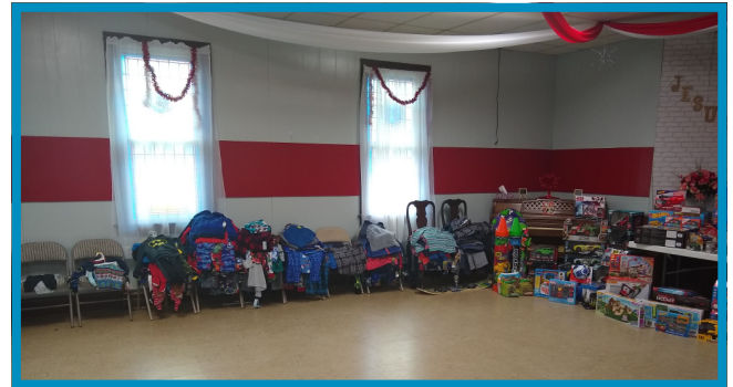
FOOD PANTRY CHRISTMAS SHOP!