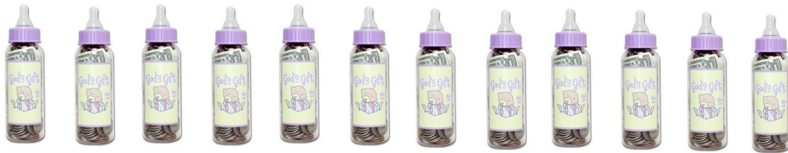
Baby bottles filled with change – that's The Baby Bottle Campaign

It's a simple idea that provides thousands of dollars to save lives. Each year the money raised from the Campaign helps support those facing unplanned pregnancies and their babies through the ministry of Care Net.