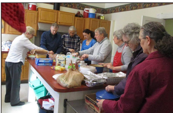
Preparing food for Your Neighbors, Inc.

We continue to provide both hands-on and financial support to The Country Pantry , our local food bank. For several years, many parishioners have helped pack and distribute food to those in need, delivering to the homebound and assisting in distribution to the general public. Currently, the Pantry serves about 750 families at its distribution each month.