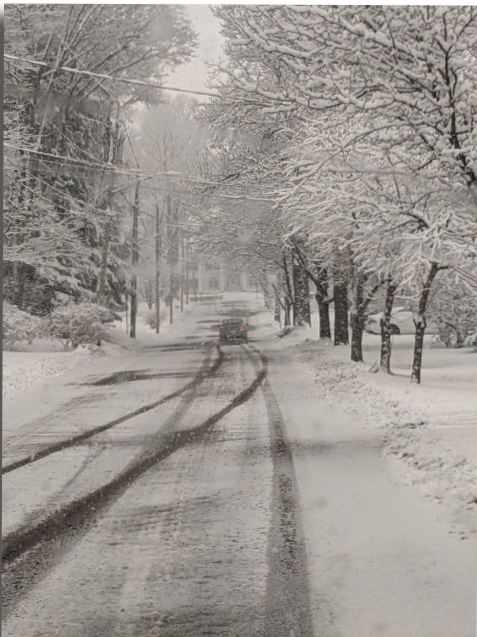
View from St. James, up Williams Street

St. James' has a well-maintained 40-rank pipe organ and a piano keyboard to accompany hymns and anthems and for organ preludes and postludes. Our devoted choir has sung a variety of music ranging from 16th and 17th century to contemporary pieces either a cappella or accompanied by the organ or piano. Youth and children's choirs have also been active in the past, and we are hoping to revitalize that effort.