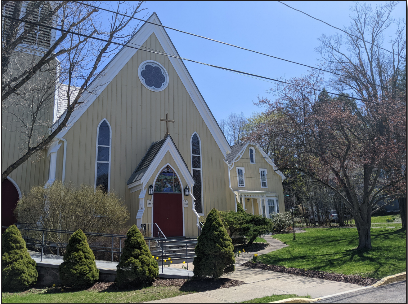
St. James', Built 1865 National Historic District

Almighty God, you know the needs of your Church in every place: look graciously upon us, the people of St. James', and grant us the guidance of your Holy Spirit as we seek a new Rector for this parish. Give us discernment, wisdom, and confidence in your timing. Grace us with continuous direction and inspire us toward genuine self-reflection. All this we ask as we walk in your ways to the glory of your name. Amen.