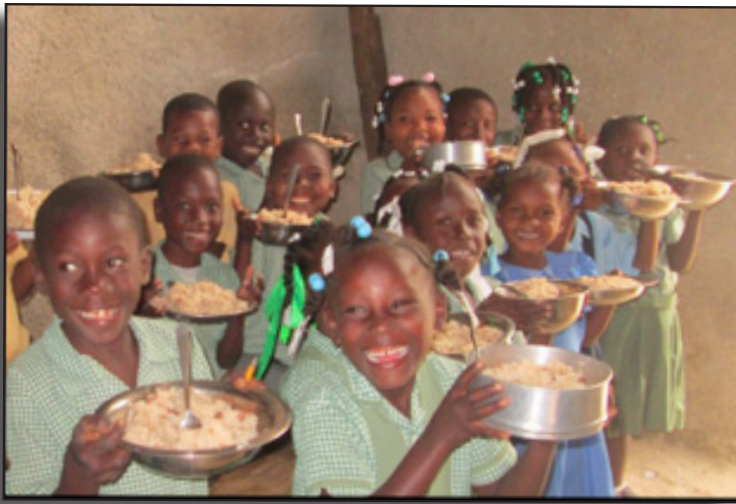
St. Paul's Parish School, Beaudin Jean Pierre, Haiti