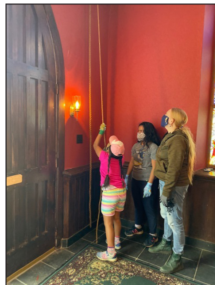
National Day of Prayer 2020

In the past, we had an active youth group who met for fellowship and Outreach activities. For fun and fellowship, there was an outing to the local Corn Maze in the fall and snow tubing in the winter. For Outreach, the youth were instrumental in helping staff the parish's Shrove Tuesday Pancake Supper. Also, they sponsored "Souper" Bowl Sunday, a canned goods collection for the local food pantry that took place on Super Bowl Sunday. They later brought the collected donations to the food pantry and helped stock the shelves. Every few years, youth had the opportunity to participate in the Nightwatch Program at St. John the Divine in New York City. Youth were also active as Acolytes , both as Crucifer, assisting at the altar, and preparing for confirmation. We appreciate and recognize the importance of these youth ministries at St. James' and are eager to see them reestablished and reinvigorated.