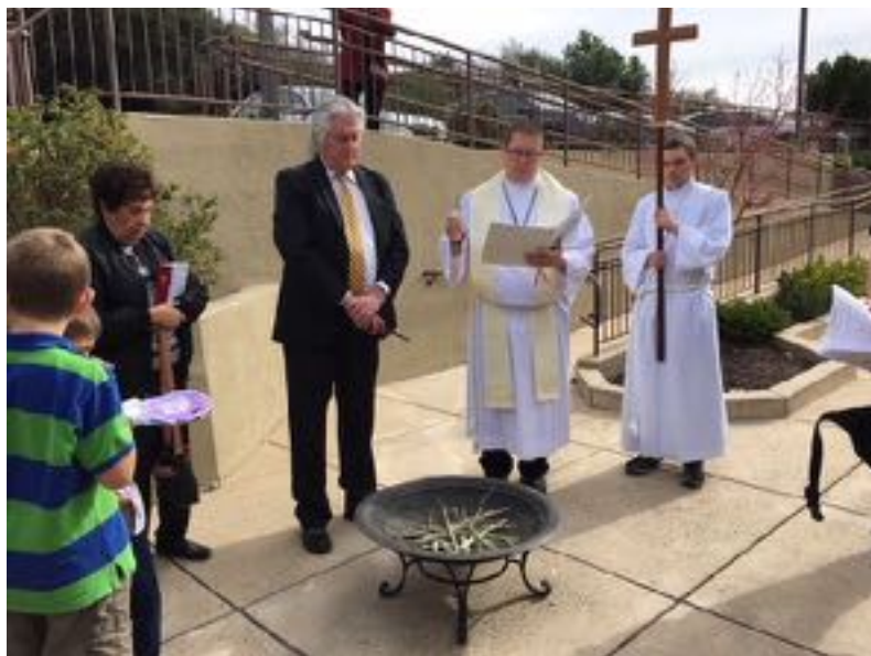
Burning of the Ashes at the end of service in the courtyard.