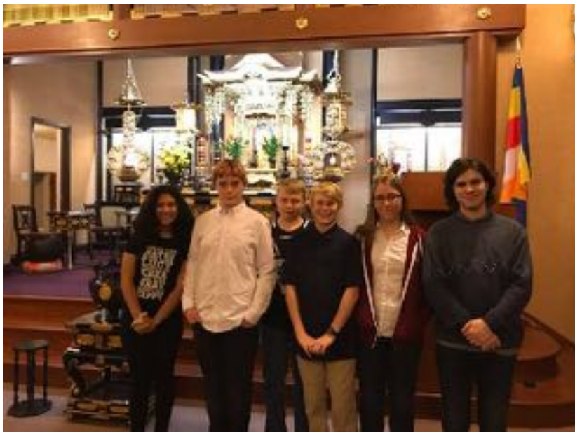
Confirmation students and a few high schoolers visiting the San Mateo Buddhist Temple.