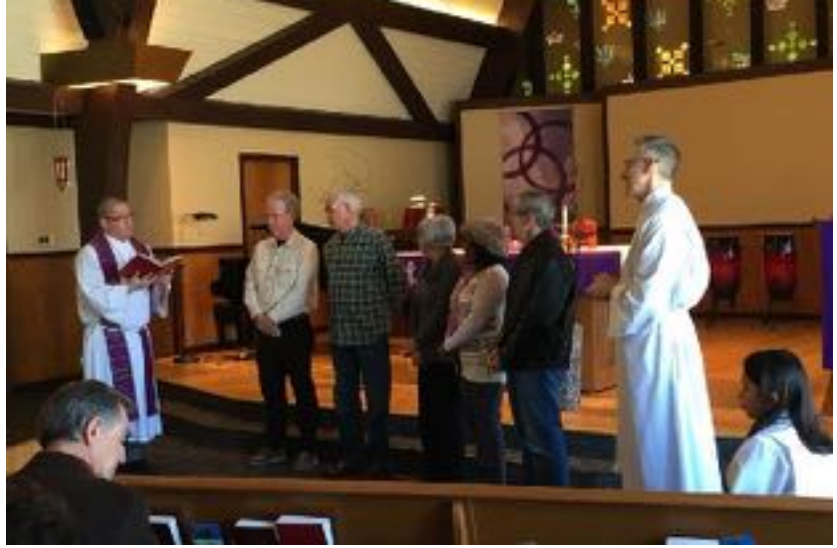
HTLC Council Installation on February 28.