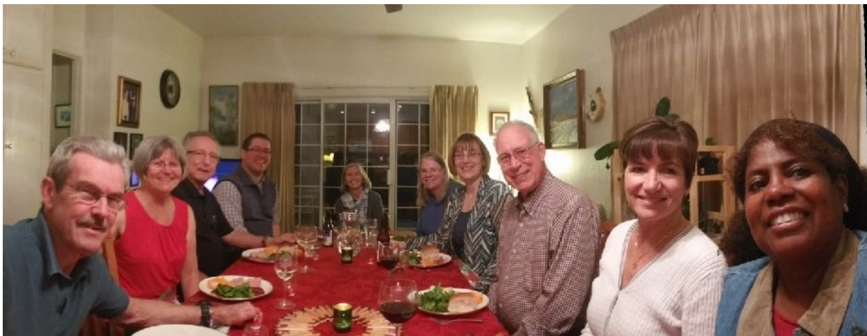
HTLC Council Meeting & Christmas Potluck