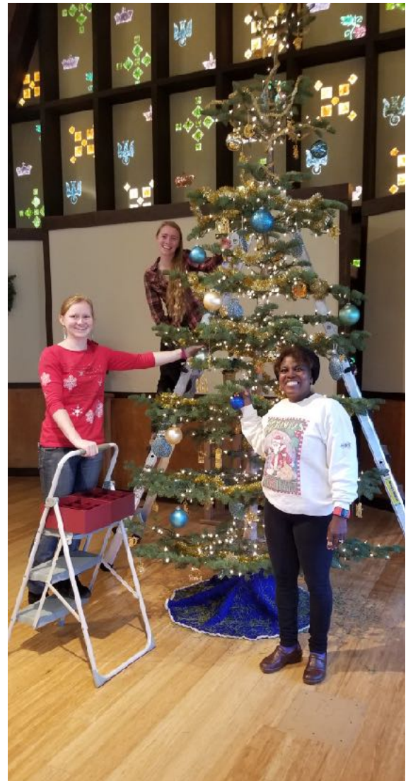
Tree Trimming and Sanctuary Decorating