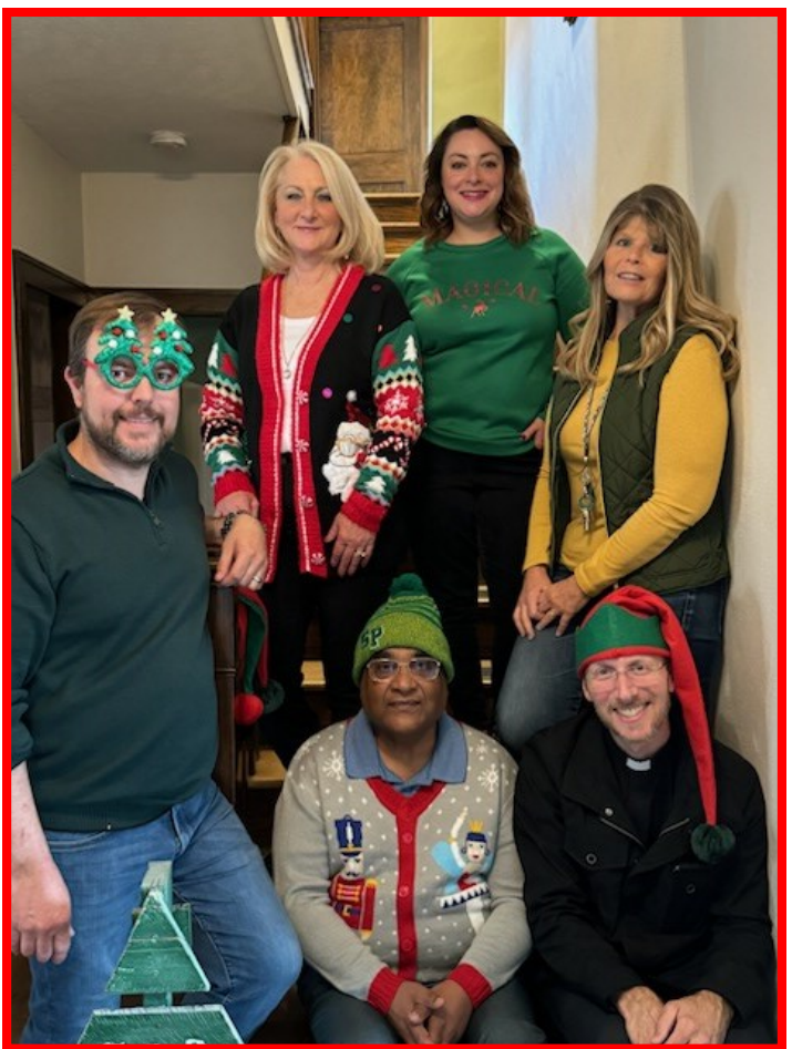
Merry Christmas and a Happy New Year from the St. Patrick's Church Staff!

-DO NOT THROW OUT your Christmas cards! Please let Catholic Daughters repurpose them into a kindness project for the next holiday season. Place the CARD FRONTS ONLY in the collection boxes available in the gathering area until the end of January. Thank you!