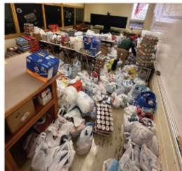
An amazing amount of donations for our food drive challenge- impacting several local families.