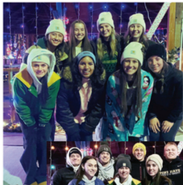
Student volunteers at the NP Historical Society

The gift of time is precious, but the joy you bring in assisting others is priceless!