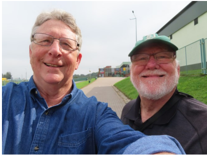
Crossing the Border