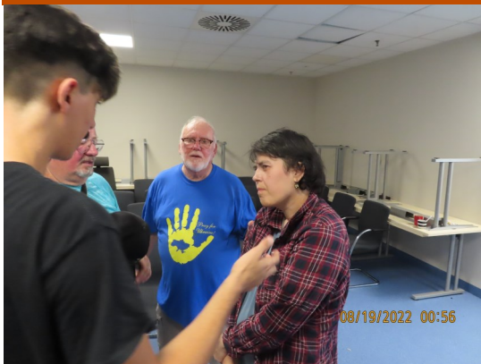
She was shot in the back, escaping her home.