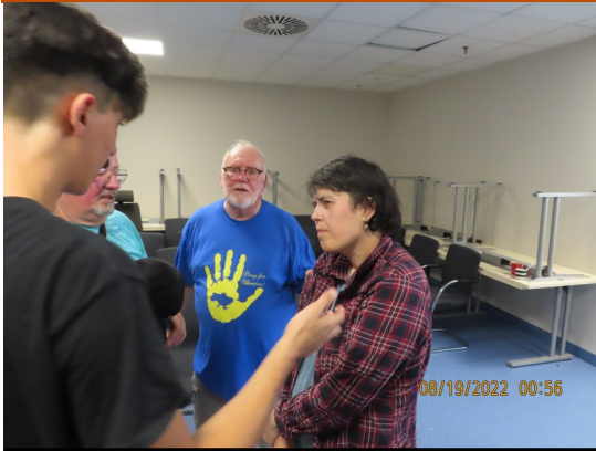
She was shot in the back, escaping her home.