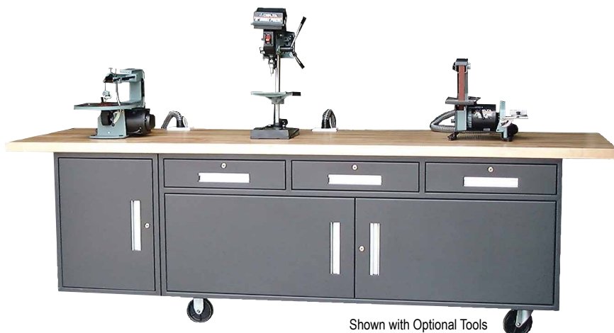
Shown with Optional Tools

Built in dust collection system features a 5 HP vacuum with (3) attachment hoses for equipment hook up. The three full extension upper drawers are ideal for tool and supply storage. The large open storage area below can be used to store tools when not in use. The 72" model has an open shelf for the vacuum while the 96" and 108" models have an enclosed vacuum cabinet.