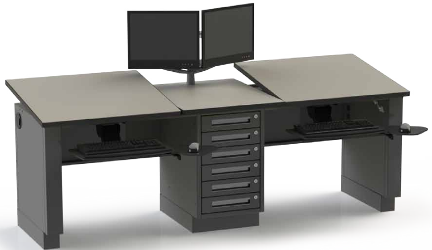
shown with optional accessories

Drafting tables are assembled from fully welded 16 and 18 gauge steel bases. On most models you have the option of a fixed 7 degree or a 10 position adjustable drafting surface.