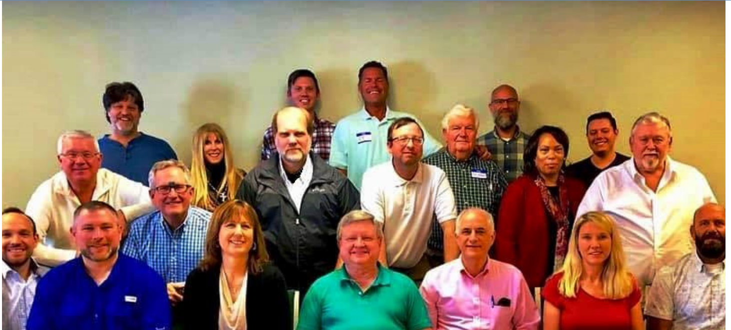
The 14th APC General Assembly Melbourne, Florida January 10-11th 2019