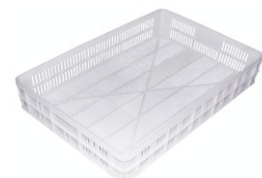
TAL F6646 660x460x95mm – 20 lt