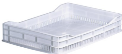
AC2 630x440x105mm – 25 lt