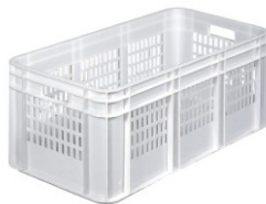
AC8 780x503x425mm- 130 lt