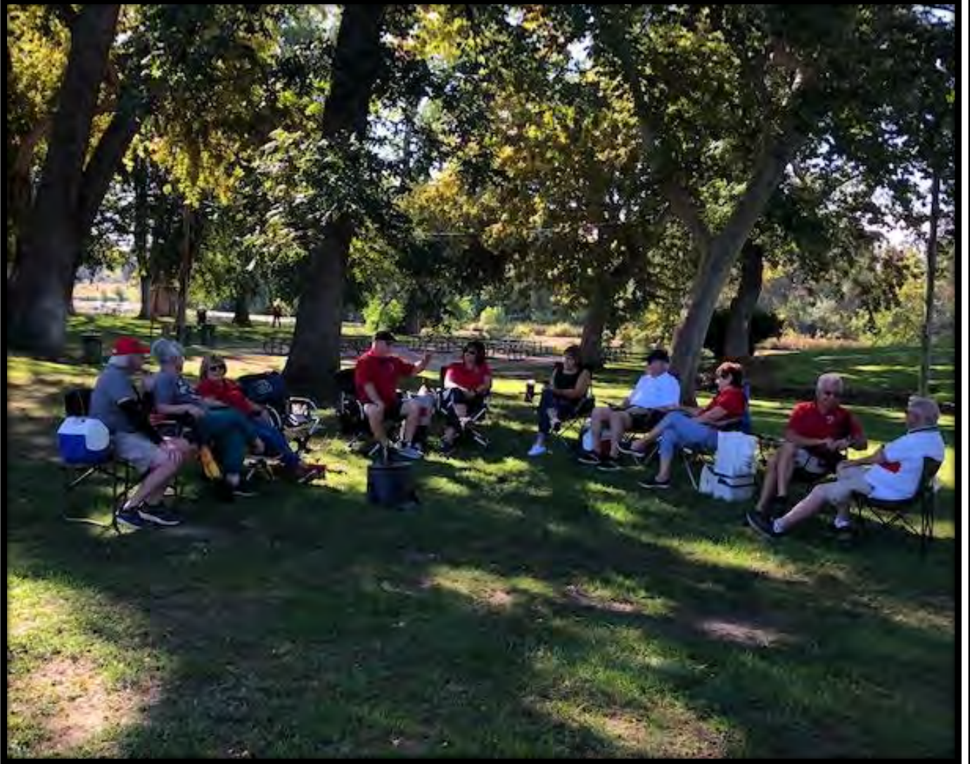
A Group Photo taken September 25, 2022 Corvettes of Fresno members at the Snelling Car Show

CORVETTES OF FRESNO, INC October 2022 Edition