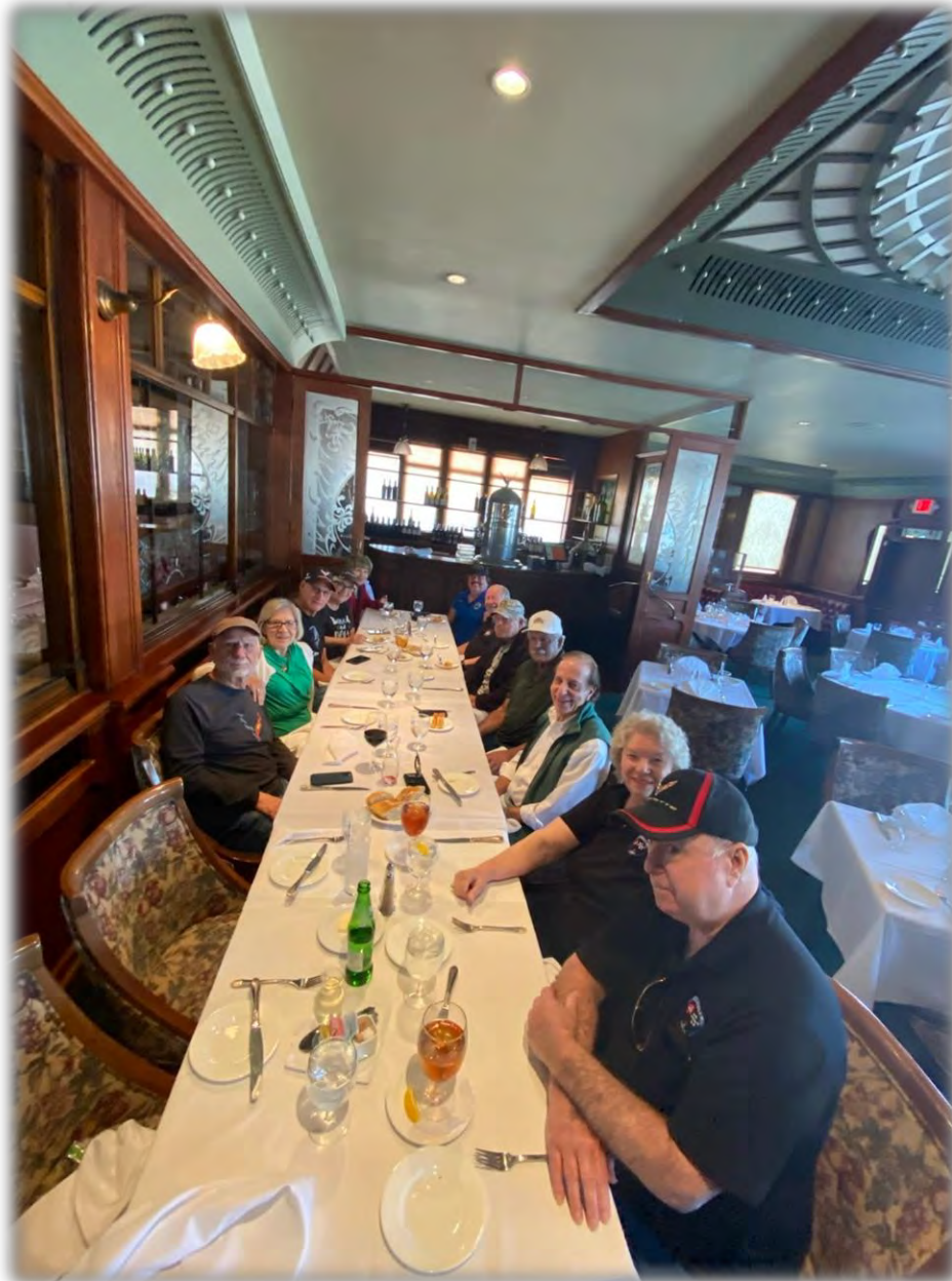
Lunch at Vintage Press following St. Patrick's Day Parade Visalia, California