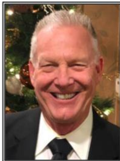
1 st Vice Pres. - Activities