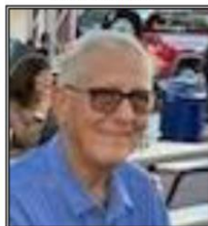
2 nd Vice Pres. - Membership