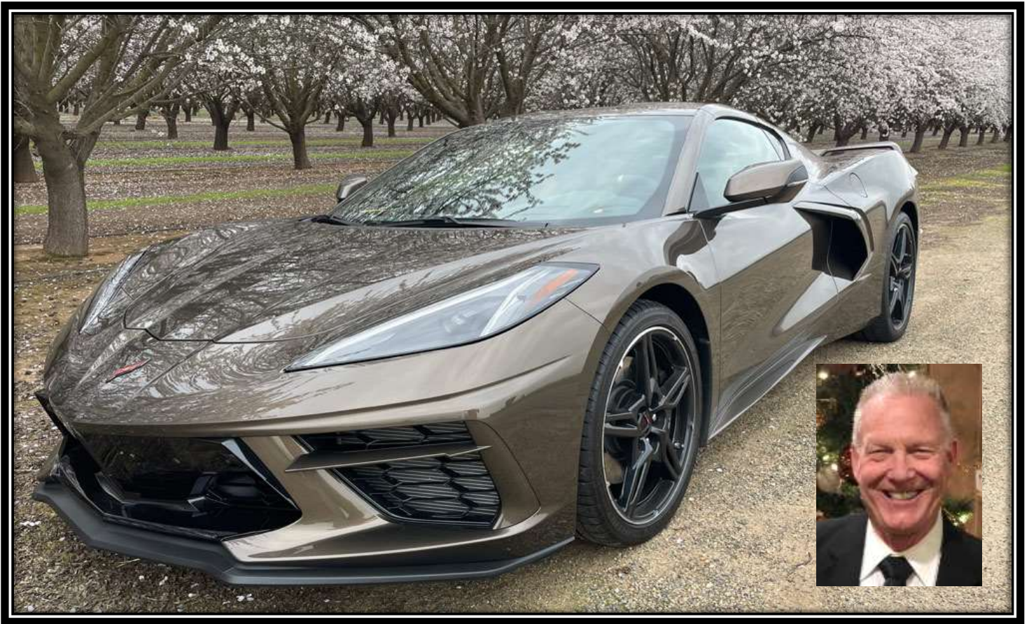
2020 Zeus Bronze Coupe

“ We joined for the car ... We stay for the People ”