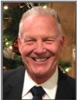
1 st Vice Pres. - Activities