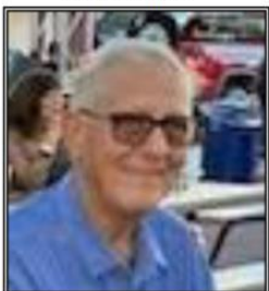
2 nd Vice Pres. - Membership