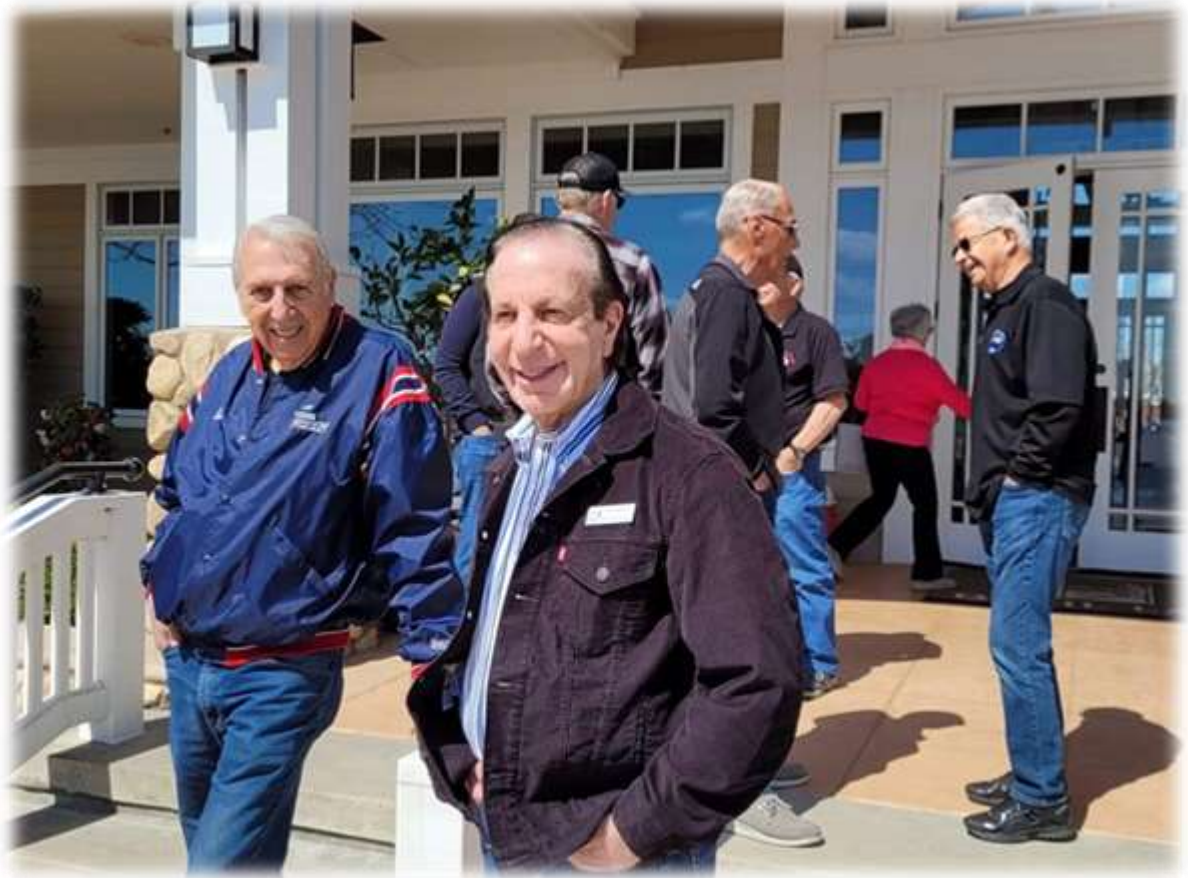
Enjoying our time together