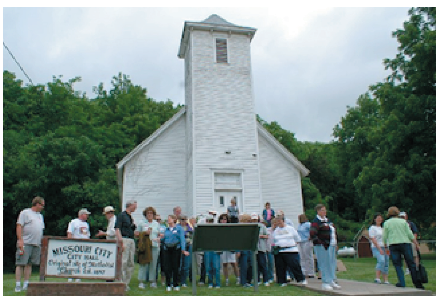
Members of the June 2, 2007, bus tour along the north side of the Missouri River, stopping at the marker at the Missouri City City Hall

Reed Karaim's article in the July/ August issue of Preservation, the magazine of the National Trust for Historic Preservation, recounts the efforts of the city of Great Falls, Montana, to build a new power plant near to the site of the Great Portage. The city wants more power for development. Local historians along with Lewis and Clark trail advocates want to preserve the area. The tension between the two groups is setting the stage for a battle. The article is available at http://www.nationaltrust. org/Magazine/current/feature3.htm.