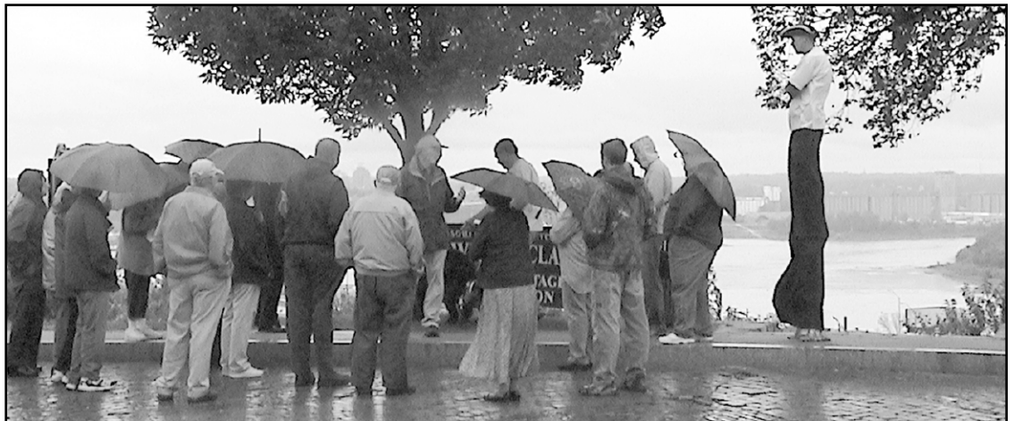
A small crowd of Lewis and Clark enthusiasts braved a drizzling rain to attend a chapter program in Case Park in downtown Kansas City on September 15, 2005.