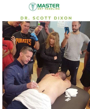
TEACHING ABOUT QL AND ILLIOPOSTALIS LUMBORUM