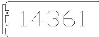
Horizontal w/Small Bracket