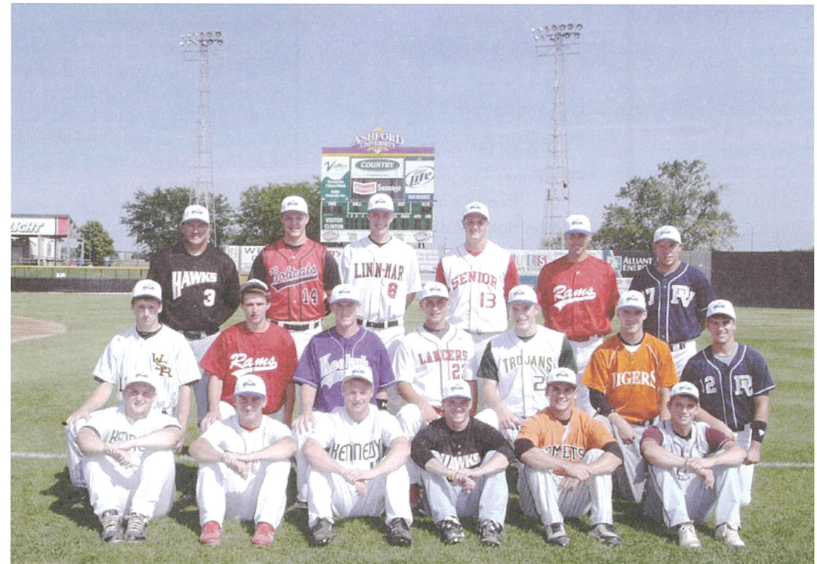
2012 All-Star Series Champions - Large East

Official Cap of the 2013 IHSBCA All-Star Series