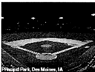
Principal Park, Des Moines, IA