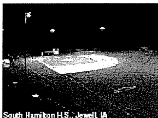
South Hamilton H.S., Jewell, IA