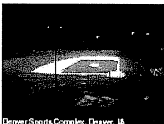
Denver Sports Complex, Denver, IA

ALL THE LIGHT AT HALF THE OPERATING COST NOT ALL THE CHEERING WILL BE FOR THE PLAYERS