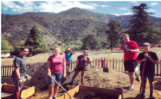
High School Youth volunteering at Luther Glen Farm for "God's Work, Our Hands", September 2017

We have hit the ground running coming into this new school year! We began our September heading up to Luther Glen Farm to lend a hand for "God's Work. Our Hands." weekend. We kicked off our normal meetings during the week of September 11, recapping our summers and collecting ideas of what we might want to do this year. Members of our Synod High School Leadership Team met to plan the High School Synod Leadership Retreat, coming this November at El Camino Pines. Kids' Club and our new "Little Kids' Club" groups began biweekly meetings on September 18, with a great turnout for our first time having a youth group opportunity for grades K-2. Our high school group hosted a Family Promise dinner toward the end of September, enjoying a meal and playing games with the families. We have