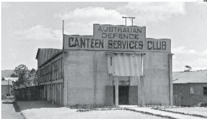
BELOW: The men's canteen operated by the Australian Army Canteens Service at Headquarters, 7th Military District, Darwin, 1946.