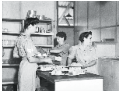
BELOW CENTRE: Staff of the Australian Women's Services Club, conducted by the Australian Army Canteens Service, preparing afternoon tea in the kitchen, Port Moresby, Papua, 1944.