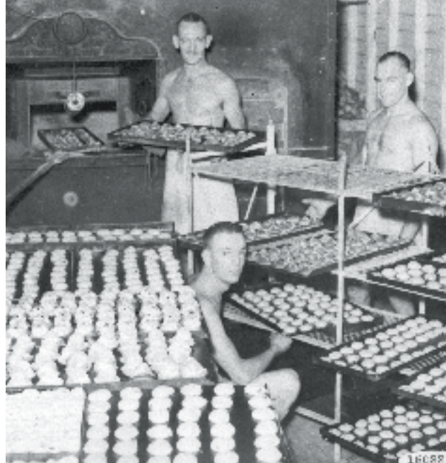
LEFT: AIF bakers at work in New Guinea, 1943. Six hundred dozen mixed cakes are cooked each day for canteen services.